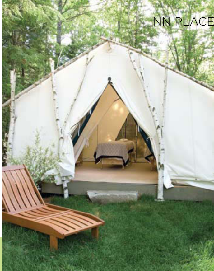
Tucked into a clearing in the balsam-scented woods is the spa tent (above) with a raised wooden platform and birch-trunk tent poles—the perfect place for a couples massage or a relaxing spa treatment.

A quiet corner of the lodge (left) invites guests to sip morning coffee or read on a rainy afternoon. Bundy and Fox drew inspiration for their design from the surrounding woods, incorporating the mossy greens, airy blues, and soft browns in furnishings and finishes.